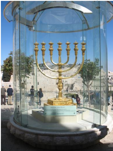
The New Menorah by the Western Wall ready for the New Temple

What is being said here is that this Anti-Christ figure will make a covenant or treaty with Israel for seven years. This is