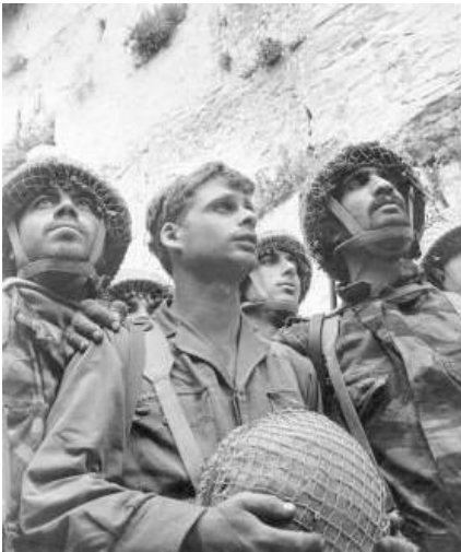
Israeli soldiers by the Western Wall in 1967

“There will be signs in sun and moon and stars, and on the earth dismay among nations, in perplexity at the roaring of the sea and the waves, men fainting from fear and the expectation of the things which are coming upon the world; for the powers of the heavens will be shaken. Then they will see the Son of Man coming in a cloud with power and great glory.” Luke 21:25-27